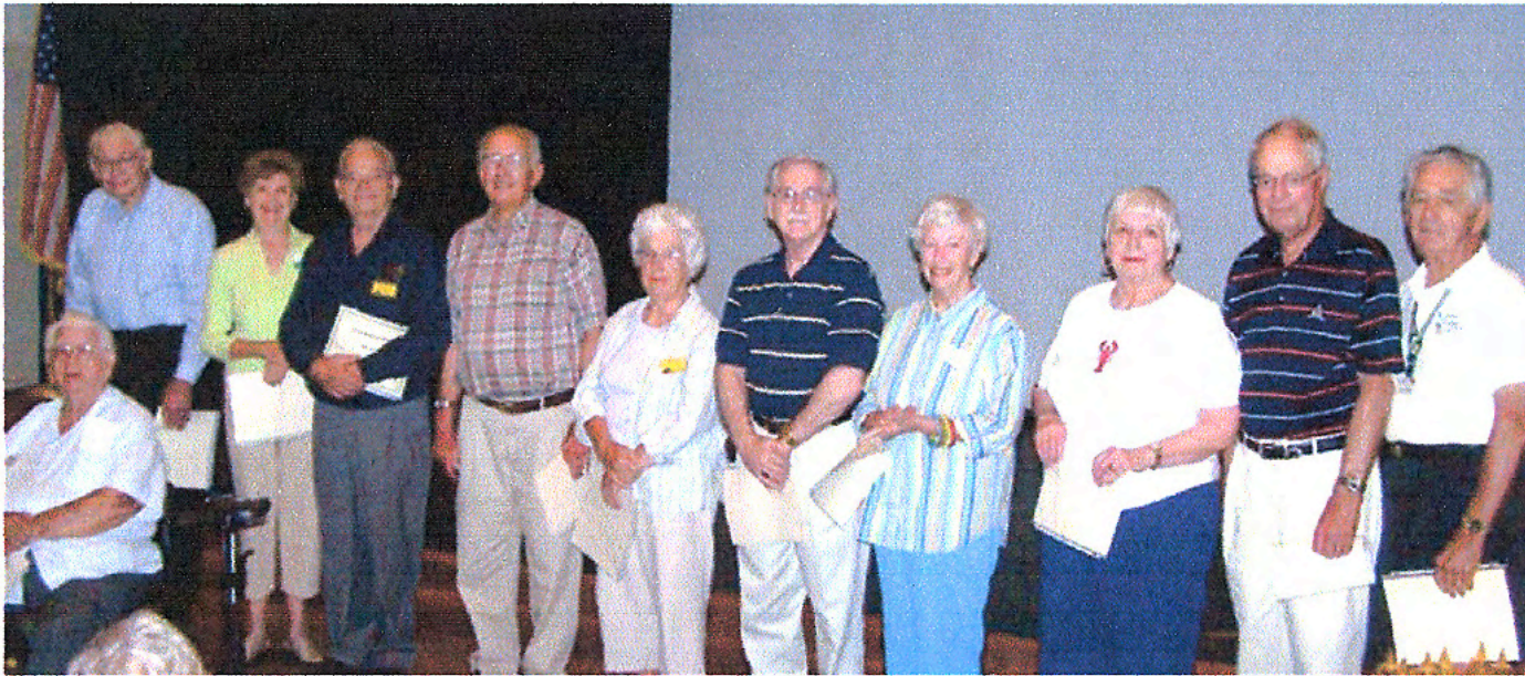
Emeritus MGs honored at the June MG monthly meeting.