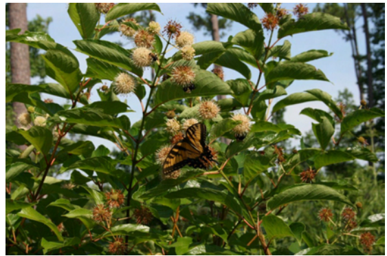
Photo: Buttonbush ( Cephalanthus occidentalis ) taken by Helen Hamilton at the Williamsburg Botanical Garden

A nectar source for two species of sphinx moths, the