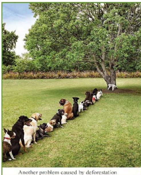
Another problem caused by deforestation