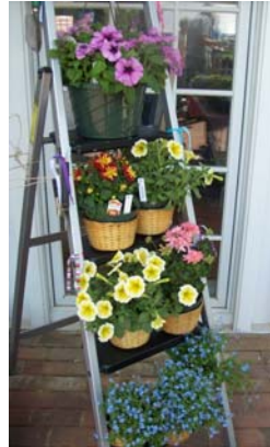
Table experts and Helpdesk were available to give customers advice. Wow! A plant sale is a lot of work! Having so many of you involved made it much easier for everyone. Many of you contributed wonderful plants, and some of you who were not able to physically lend a hand helped by sponsoring an area. I'd say we came very close to the 100% participation that the steering committee was seeking!