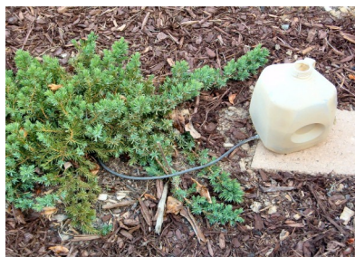
←← Drip bottle in place

He sent the following photos that show the materials he uses and how they are assembled. The materials include an empty gallon plastic bottle, a length of 1/4" drip irrigation tubing, an adjustable dripper for one end of the tubing, a connector to join the tubing to the bottle, and a tool to punch a hole in the bottle. The hole is made in the lower part of the bottle. The tubing is attached to one end of the connector, and the other end is inserted into the hole in the bottle. Gerhard uses a little epoxy glue around the hole after the connector is inserted to seal the joint. The dripper is attached to the other end of the tubing. Once the epoxy has dried, the unit can be placed next to your newly planted shrub. Take the cap off the bottle fill it with water, and the water will slowly drip out to wet the soil around your new plant. Thanks for sharing this. CF