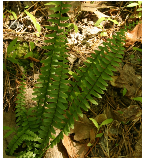
Photo: Ebony Spleenwort ( Asplenium platyneuron ) taken by Helen Hamilton

This little fern grows in moist but well-drained locations throughout eastern U.S. Very adaptable, it occurs in open woodland, on rocky banks, and on rotting logs, but thrives especially in thickets and other disturbed areas. Frequently colonizing masonry in urban and rural sites, it prefers calcareous rocks (or mortar joints) but will also grow on subacid rock. Ranging from Quebec to Kansas and Colorado and south to Florida, Texas and Arizona, Ebony Spleenwort is found in every county in Virginia. Spores are formed May through September.