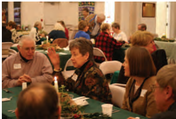
Scene from the Graduation Dinner January 15, 2009.

The purpose of the James City County/Williamsburg Master Gardener is to learn, educate, and communicate environmentally sound horticultural practices to the community. Trained by the Virginia Cooperative Extension, Master Gardener volunteers are committed to offering information to the public through sustainable landscape management educational programs.