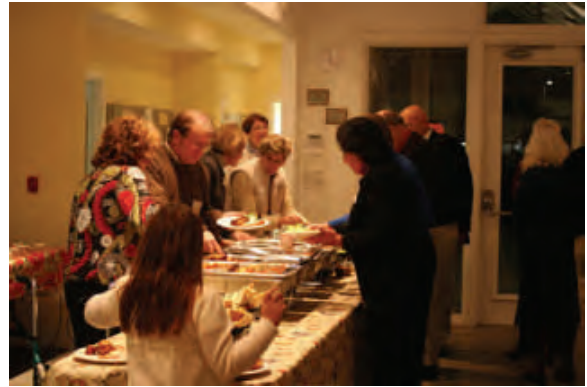
Scene from the Graduation Dinner January 15, 2009.