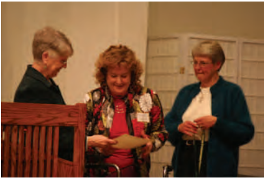
Scene from the Graduation Dinner January 15, 2009.

We will need to be creative in this process and do our ground work before the plant sale. We will have a planning meeting early in February. If you would like to volunteer for this task please let me know by e-mail ( arthurg@cox.net ) or just give me a call (564-1888).