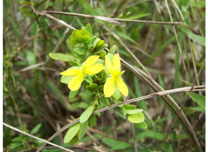
St. Andrews Cross ( Hypericum hypericoides)

St. Andrew's Cross grows in dry or moist, sandy or rocky soils from New Jersey to Oklahoma and south to Florida, Texas and Central America. The blooming period is early, from May through August. St. Peter's Wort grows in damp, sandy soil from Long Island to Oklahoma and eastern Texas, blooming later, from June through October.