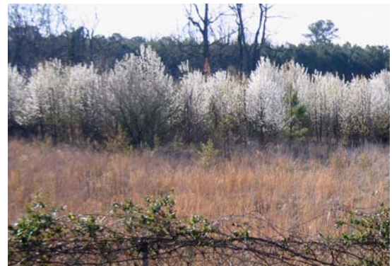
taken from Rt 199 near Rt 5

The Pears grow in very dense populations and they come up as a reverted form that often has thorns. In light of this, I recommend that people do not plant any of the cultivars of Pyrus calleryana .